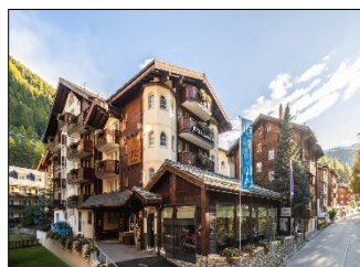
4 Star Hotel Albana Real